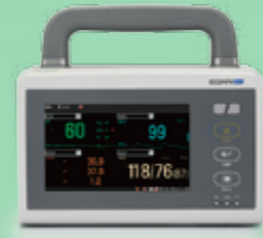
iM20 Patient Monitor