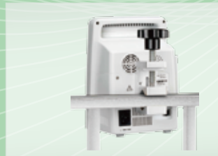
Bed Rail Clamp